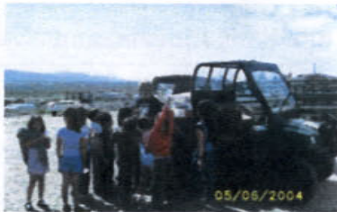
Teaching kids hands-on about weeds.

Education: Tri-County Weed Control offers support with educational contributions. We offer training and materials on all aspects of weed control including: weed identification; inventory and GPS data of land; chemical applications; control and prevention of infestations.